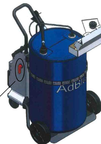
Adjustable flow rate, from 5 to 11 lt/min

The entire process is automatic and no risks to overflow thanks to the PIUSI patented filling sensor that stops the flow AUTOMATICALLY